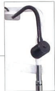
Improved back ground illumination system and fixation lamp.