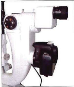
Built-in digital adaptor system