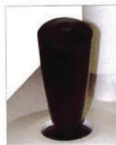
With photo joy stick equipment, simple and convenient operation