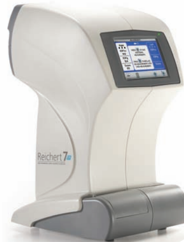
Reichert 7CR Auto Tonometer + Corneal Response Technology